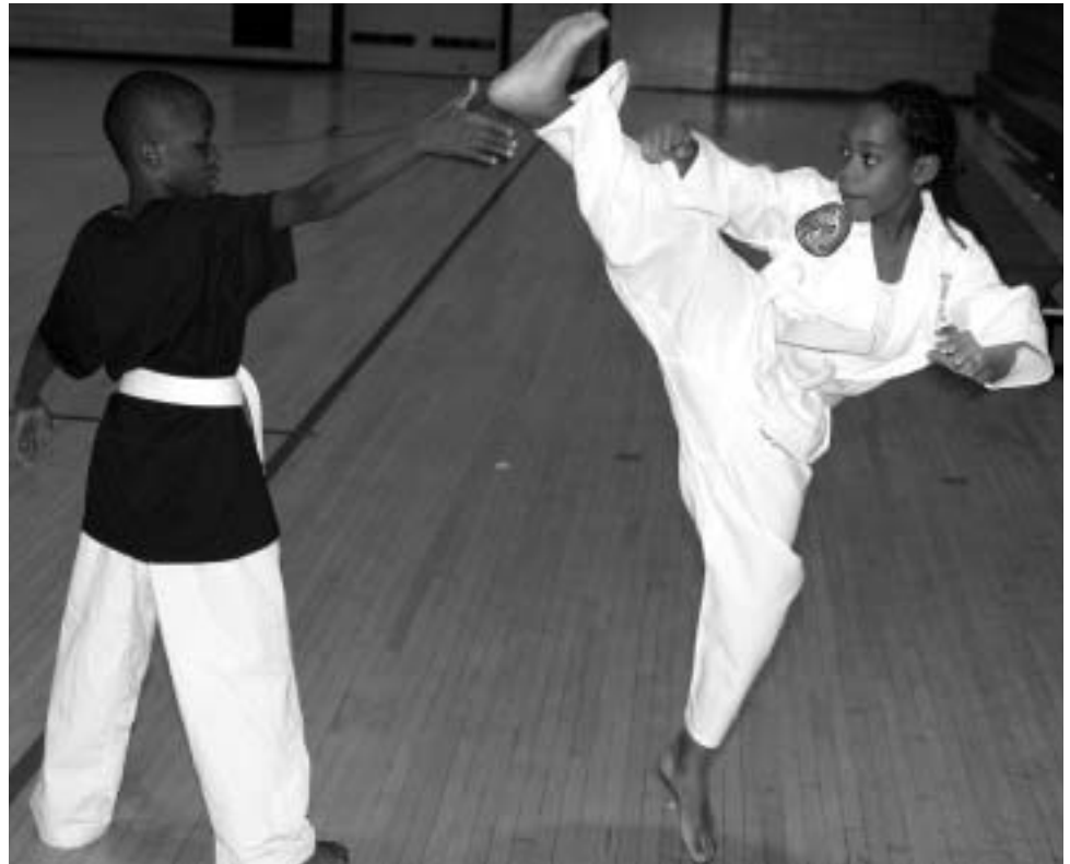
The Harlem Children’s Zone is dedicated to improving the lives of kids up to age 18 in central Harlem. Specifically HCZ seeks to put Harlem youths on an educational par with their middle-class peers.